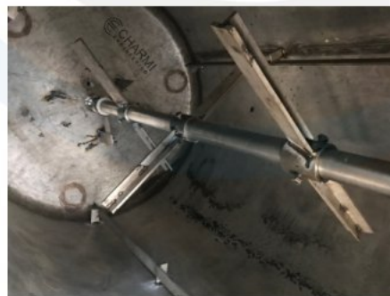
GUD (JAGGERY) MIXING TANK – CE026

Material : Stainless Steel , Mild Steel , Carbon Steel