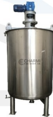
LOW MIXING TANK – CE024