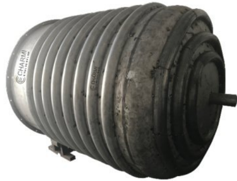
LIMPET MIXING TANK – CE022