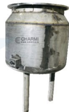
OINTMENT VESSEL – CE030