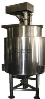
FOOD MIXING TANK – CE025