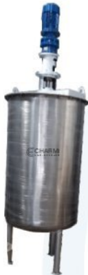
HIGH SPEED MIXING TANK – CE023