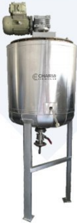
JACKETED MIXING TANK – CE021